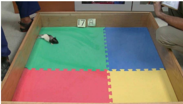
Figure 1. Locomotion in open-field test (1 st day post injury – DPI 1)

tests analyze the coordination through accuracy of placement. Successful performance in these tests of accurate foot placement indicate significant recovery in pathways from the brain to the spinal cord, like the corticospinal tract. The grid walk allows the rats' steps to be analyzed by watching video recordings of each. Each step is categorized as a slip, miss, adjustment, or correct step (Figures 2 and 3). These numbers are then compiled to compare the number of correct steps versus number of incorrect steps within 30 seconds (Kunkel-Bagden et al., 1993).