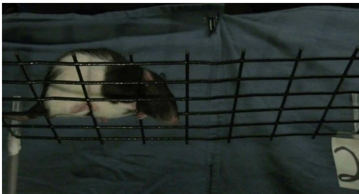
Figure 2. Correct step in grid walk test (DPI 35)