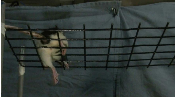
Figure 3. Miss or slip in grid walk test—characterized as a miss if the paw went straight through center of grid; characterized as a slip if the paw slipped off the edge of grid (DPI 35)

The terminal surgery was performed 8 to 10 weeks after the injury in order to measure electrophysiological responses of motor neurons to injection of current through a microelectrode and synaptic input from muscle spindles, movement sensors in muscle.